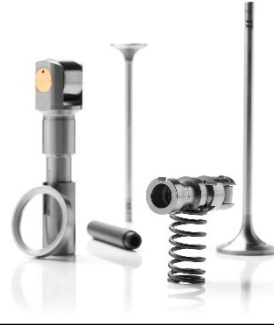
Valve Train Parts