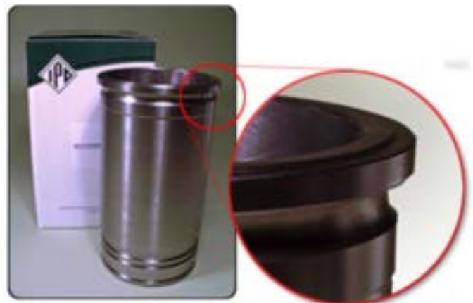
U.S. Patent #7334546

For current program details, please reference IPD's on-line Quick Reference listing for this product line ( click here for link ).